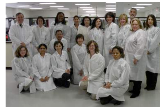
SPAC Delegates with NJCBB staff

In 2005, New Jersey was the first to create a statewide, publicly funded umbilical cord blood bank - NJCBB. Cord blood stem cells treat many life-threatening diseases like leukemia and sickle cell anemia. SPAC is working to raise awareness about the ease of donating cord blood amongst diverse communities, and also to ensure the survival of the NJCBB.